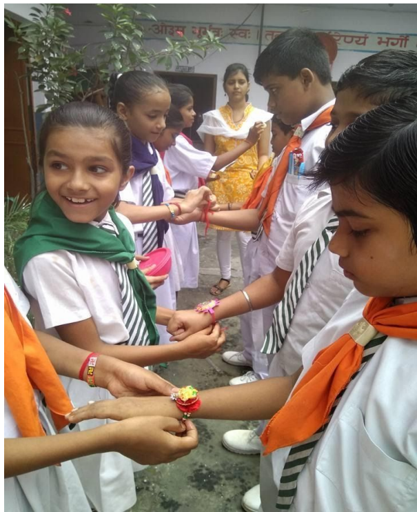
AAJADI ke RANG , BACHHO ke SANG